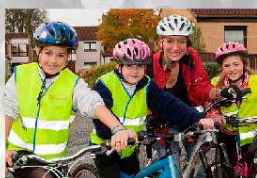
Alan Laughlin / Sustrans